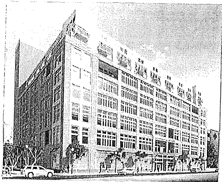
Turchi Properties has converted an AAA parking garage into an 85-unit condominium project called 23. The project is located at 23 South 23rd Street, between Center City and the University City district of Philadelphia and adjacent to the Schuylkill Riverfront.